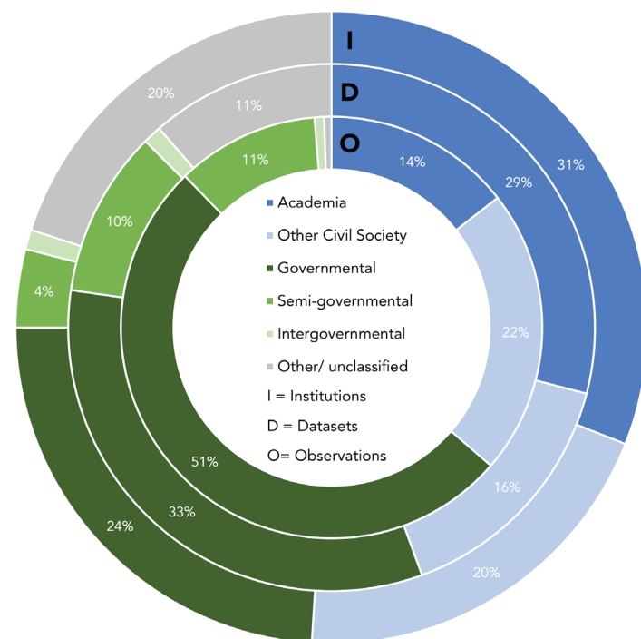
Figure 3: The diversity of ABNJ contributions to OBIS by Institution (I), Datasets (D) and Observations (O). Together, Academia and Civil Society make up the majority of contributing institutions, 45% of all datasets and 36% of all observations.

the origin of observations located in ABNJ in OBIS and classified the contributing institutions into six categories: academia; other civil society organizations, governmental, semi-governmental, intergovernmental and other/uncategorized.